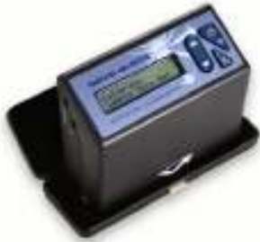
Place the instrument in the calibration holder.

If the instrument has not been used for some time it is advisable to check the calibration. Place the instrument on the high gloss calibration tile. Take a reading by pressing the READ/SELECT key. Compare the measured value with the assigned value for the tile. If it matches the value on the tile holder, the instrument is within calibration and ready for use.