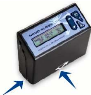
The measurement position is indicated by the arrows.

When the instrument is placed on a sample the aperture is hidden, the centre of the measurement area can be pinpointed by the intersection of the arrows marked on the front of the instrument case with those on the side.